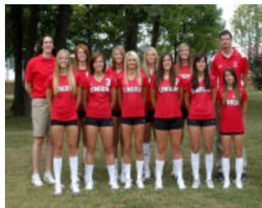
The 2008 Union University Volleyball Team

volleyball team is doing and can come support us more.