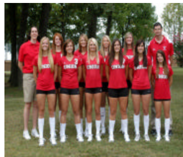
The 2008 Union University Volleyball Team

Tournament. They finished 3-1 in the tournament—winning 3-0 against Bethany College, 3-1