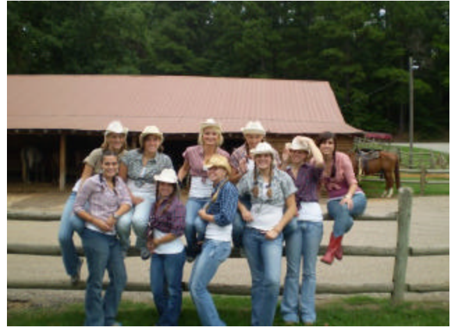
Union Volleyball 08— Horseback riding in pre-season.