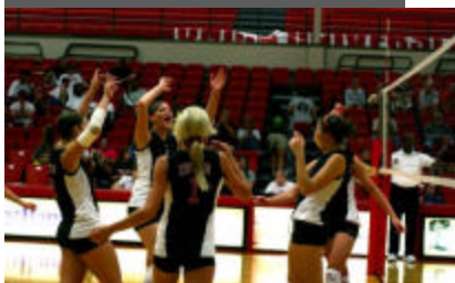
Lady Bulldog Volleyball team celebrates after a big kill.