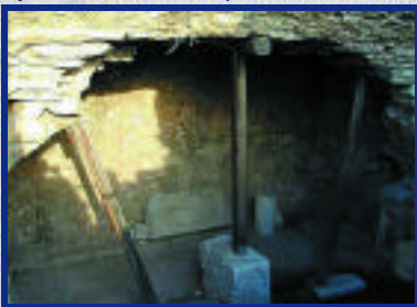
Traditional Site of Philippian Jail

Today we will drive into northeastern Greece to visit the ruins of the ancient city of Philippi, founded by and named for Philip II. On the way we will stop at the Lion Statue in Amphipolis. This statue was prominent on the ancient Egnatian Way that Paul would have traveled between Philippi and Thessalonica. In Philippi we will see ruins of the city where Marc Anthony defeated the armies of Brutus and Cassius. The Bible tells us that Paul and Silas came to Philippi in response to the Macedonian call (Acts 16:9). It was here that Paul won his first European convert, a woman named Lydia from the city of Thyatira. Some of the remains we will see at Philippi include the ancient theater, the agora, the acropolis, the Baptistery of Lydia, the market place where Paul and Silas were brought before the rulers, and the cistern which tradition identifies as the place where Paul and Silas were imprisoned. After lunch we continue to Kavala and the ancient port of Neopolis, then return to Thessaloniki for dinner and overnight at our hotel (B/L/D).