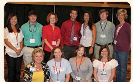
TPA Group Photo