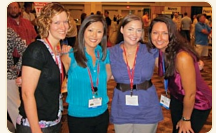
Attending the Exhibitions.

In July 2011, members of TSSP attended the Tennessee Pharmacists Association Annual Meeting in Kingsport, TN.