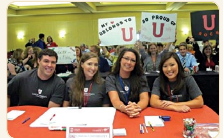
OTC Competition with our supporters.