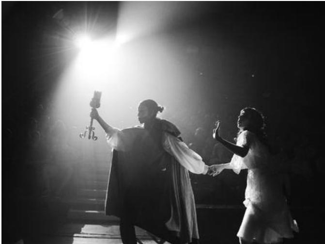
A scene from Zeta Tau Alpha's performance of "Phantom of the Opera" at the 16th annual Variety Show

Senior Vice President for Student Services and Dean of Students