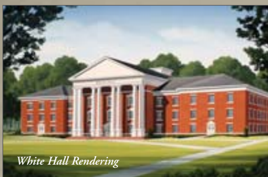
White Hall Rendering