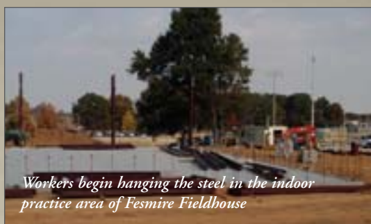
Workers begin hanging the steel in the indoor practice area of Fesmire Fieldhouse