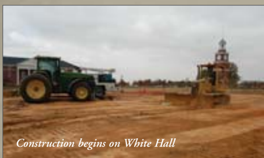
Construction begins on White Hall